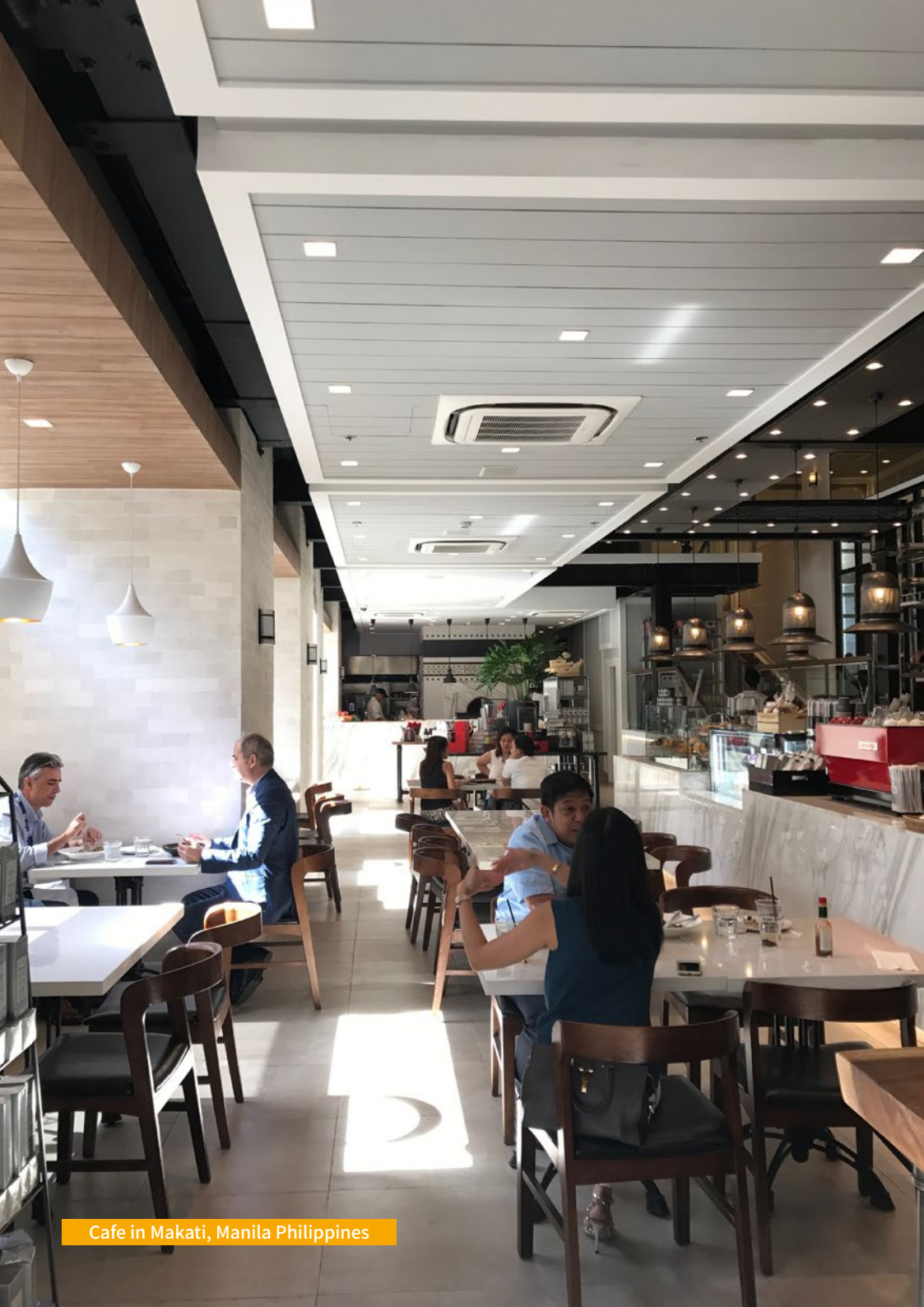
Cafe in Makati, Manila Philippines